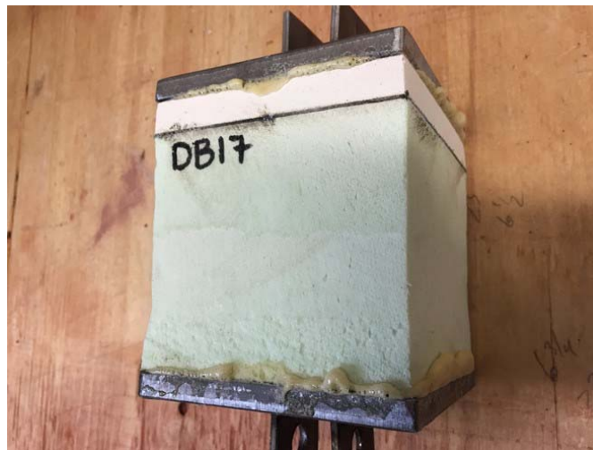
Figure 1 : Prepared Foam sample installed on Blueskin SA for testing

Testing was completed in substantial compliance with ASTM D1623-03 (Standard Test Method for Tensile and Tensile Adhesion Properties of Rigid Cellular Plastics) for a Type C specimen. Samples 4" by 4" (16 sq. inches) in surface area and 4" in total thickness (including DensGlass sheathing) were chosen. A photograph of a sample is shown in Figure 1. The objective of the test was to demonstrate that the adhesion of the spray foam to the substrate (DensGlass or Blueskin SA in this case) exceeded the Air Barrier Association of America (ABAA) adhesion requirement for an air barrier material on a substrate of 16 psi (110kPa). For the 4"x4" sample size chosen, a load of 256 lbs was the minimum target.